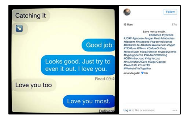
Figure 2. A text message exchange [5] between mother and daughter on managing dropping blood glucose with realtime data using Nightscout. "Catching" low blood glucose levels involved parental emotional care work that attends to the person, not just the number.

eats...We change basal rates and bolus rates [used in insulin treatments] and sensitivities. We try to do the best we can." While steady glucose levels can lead to improved long-term health outcomes, the pursuit of 'good numbers' can sometimes conflict with 'good care.' Later in the same interview, this father wryly acknowledged to us that his teenage daughter "didn't love" her parent's obsession with her data: "We were checking her too much...And she wants to shoot me sometimes, and my wife as well sometimes, because we are always on her about her diabetes...I've got to watch that, because I'm on her too much...There's definitely a quality of life thing to this...I know I don't have the right mix."