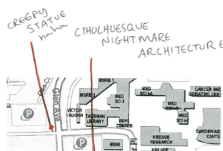
Fig. 2. Some participants labeled unusual locations in hopes to inspire certain emotions in their audience.