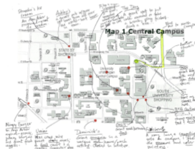
Fig. 1. Participants annotated paper maps with information they wanted to share with their peers.

I would hope that people would recognize some of these landmarks, if you'll call them that, or be curious about certain places. (p3.06)