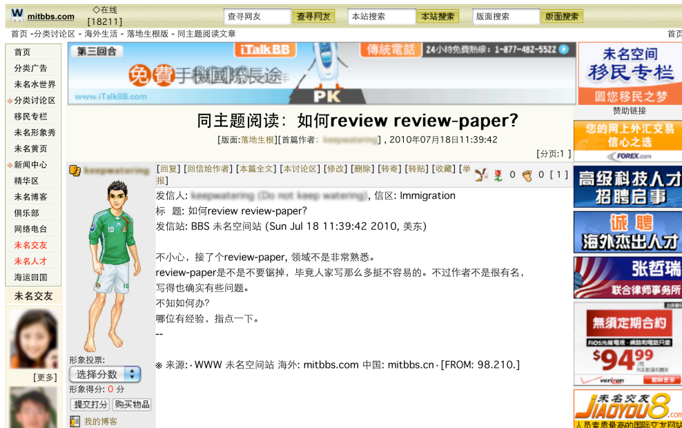
Figure 1: Typical post page for Mitbbs: a user is asking “how to review a review-paper” in Immigration , where there might be senior people in academia to answer this question.

Table 1 lists the Chinese terms that will be important to our discussion in this paper, including a rough translation. The reader is reminded that terms relating to Chinese culture seldom translate precisely to English, and it is important to focus on the Chinese concept rather than its English translation.